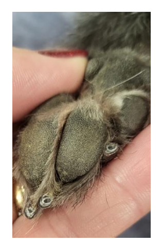
Cat Nail Trim

Stop trimming when the dot in the center of the nail becomes visible. This is the start of the quick.